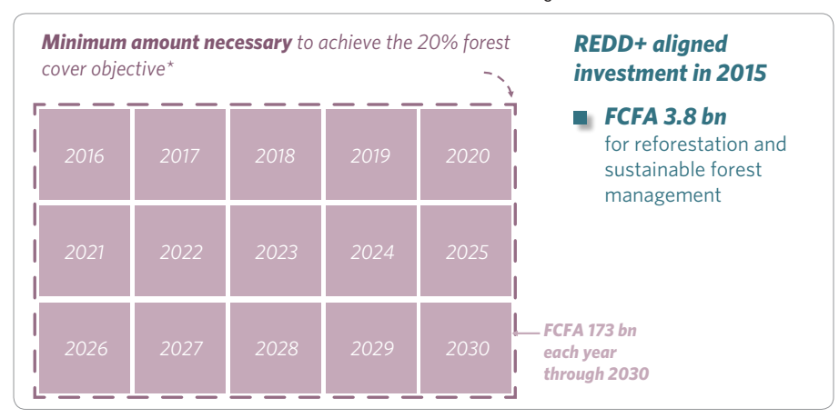
Figure 2: 2015 investments in reforestation and sustainable forest management versus estimated annual minimum needs to meet the 2030 20% forest cover target

* Preliminary estimate: includes costs for planting and plantation maintenance only. Does not include administrative or indirect costs, such as security personnel, identifying and negotiating alternative livelihoods for current forest users and establishing new protected areas.