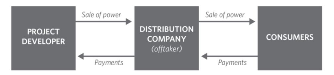
Figure 1: Cash flows in a renewable energy project

The ability of an off-taker to make payments depends on its credit worthiness. In India, the majority of off-takers are state-level public sector electricity distribution companies (DISCOMs). Most DISCOMs in India are in a poor financial state. State-level DISCOMs, with collective debt of INR 3.04 trillion and losses of INR 2.52 trillion, are on the brink of financial collapse (Livemint, 2014).