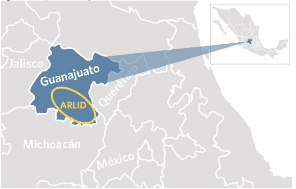
Figure 2. Map of Guanajuato

The pilot project is centered around grains production in the Alto Rio Lerma Irrigation District (ARLID), due to the interest of FEMSA Foundation, which sources grains from the region. Climate change severely threatens grains yields in the region, and for example barley yields losses are estimated from 3% to 17% (Beverage Daily, 2018).